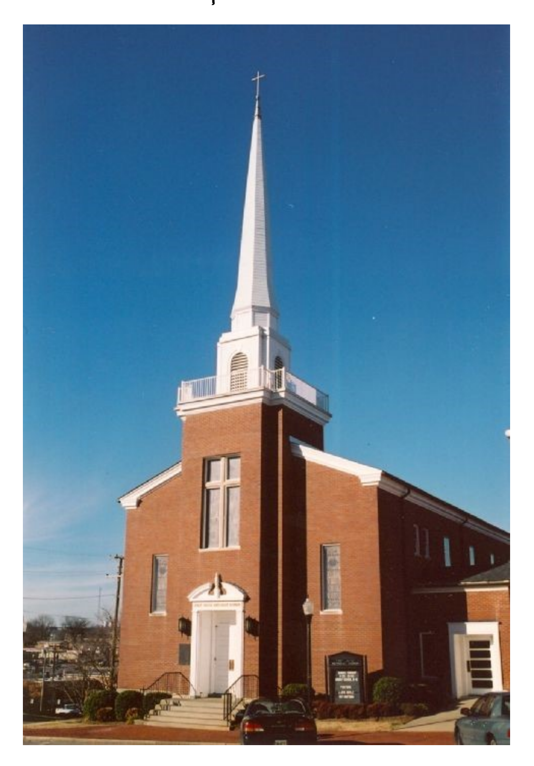
Welcome to all!

We hope and pray that all will experience God's love and grace in all we do and say.